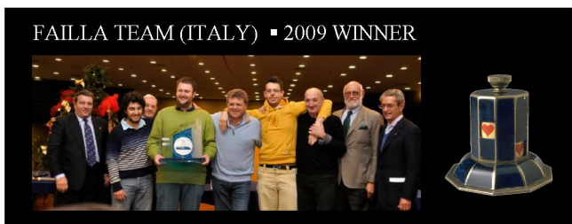
FAILLA TEAM (ITALY) ■ 2009 WINNER